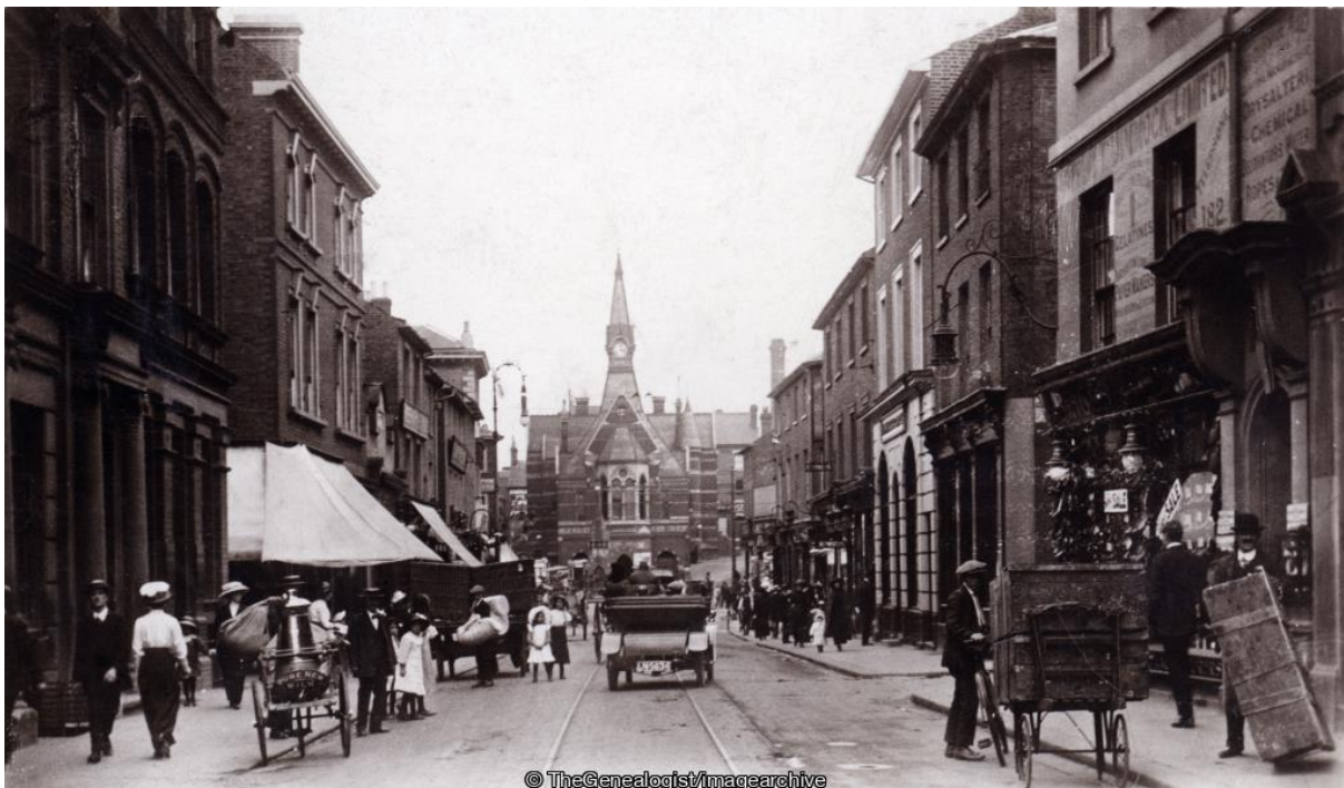
The Corn Exchange, Luton

TheGenealogist has once again expanded its Landowner and Occupier Collection with the release of over 134,000 new Lloyd George Domesday land tax records . This latest addition covers more than 355 square miles of Hertfordshire and Bedfordshire, including areas around Watford, St Albans, and Hemel Hempstead, and extending up to Luton, Dunstable, and Toddington. The records provide a fascinating insight into the lives of our ancestors, enabling researchers to uncover the owners and occupiers of properties between 1910 and 1915, as well as details about the size, state of repair, and value of their homes.