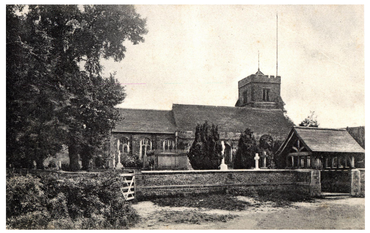
St Martin's Church Ruislip

Property records, such as these that were uniquely digitised by TheGenealogist from the originals at The National Archives, allow house and family history researchers the ability to unearth information that had been recorded by the authorities about the owners and occupiers of the homes, land, outbuildings and property at the time.